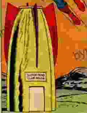
YOUR HEAD CLEAR PHOENIX