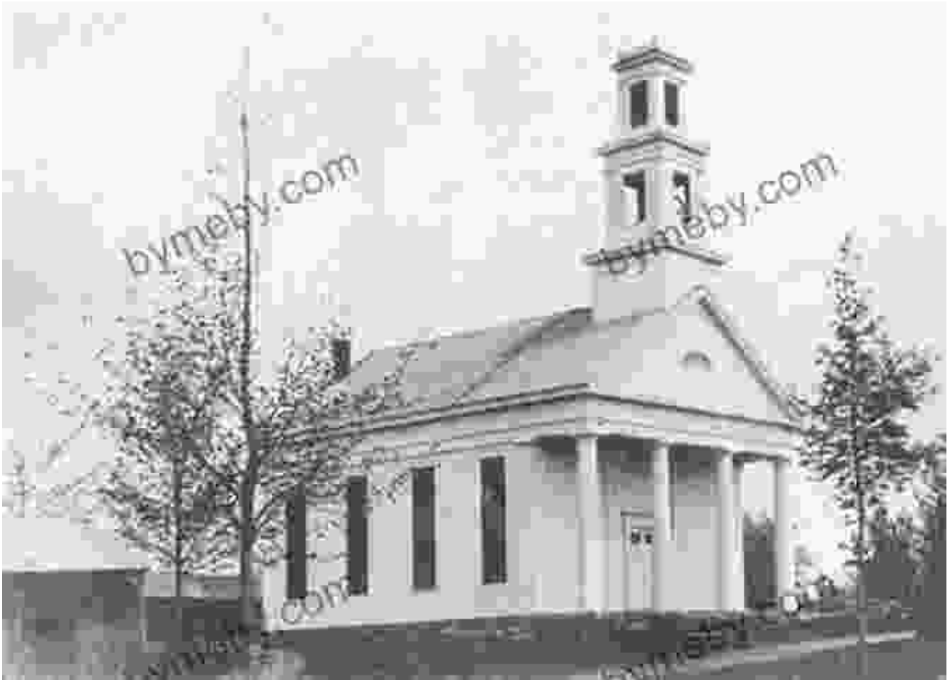
A Puritan church in Connecticut during the 17th century

The Puritans who founded Connecticut were deeply religious, and their beliefs permeated every aspect of society. The church played a central role in both spiritual and civic life. The colony's social structure reflected Puritan values, with a strict moral code and a focus on education and literacy.