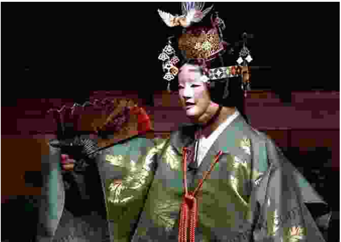
Noh Theater in the Shogunate Court

Yet, Takahashi's exploration of power extends beyond the battlefield and the political court. He illuminates the ways in which power manifested itself in the arts, religion, and everyday life of the shogunate era. Readers will encounter stories of talented artisans, enigmatic priests, and resilient women, all of whom played their own roles in shaping the cultural landscape of the time.