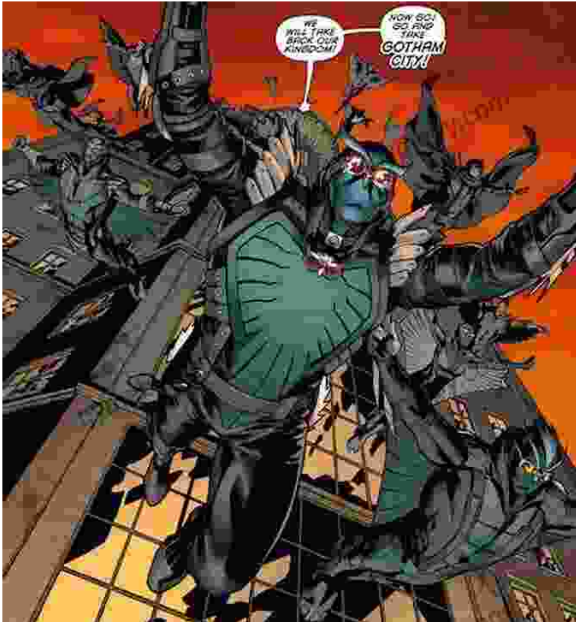
Batman faces off against the Talons, the elite assassins of the Court of Owls.

As Batman faces the formidable challenge of the Court of Owls, his resolve is tested like never before. Stripped of his gadgets and allies, he must rely on his own wits and determination to unravel the sinister conspiracy and protect Gotham City.