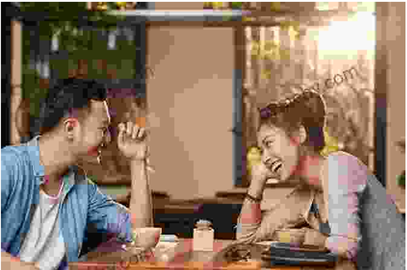
Image Alt: A couple sitting at a table in a cafe, engaged in a lively conversation and laughing together.