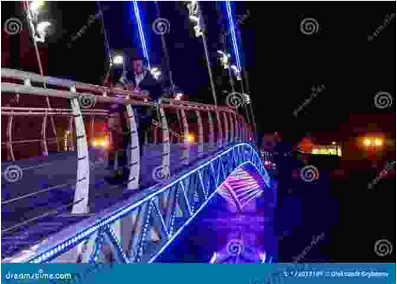
Image Alt: A couple engaged in a deep conversation while walking on a bridge overlooking a river and city skyline.