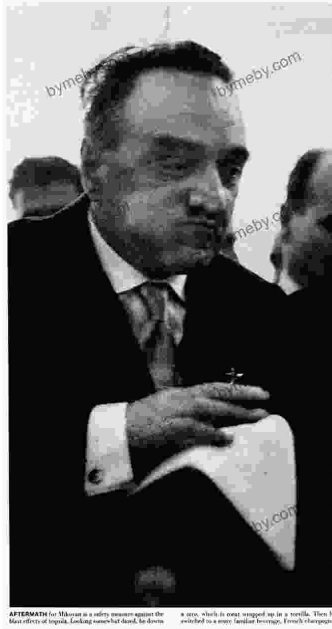
AFTERMATH for Mikoyan is a safety measure against the blast effects of topola. Looking somewhat dazed, he downs a cocoo, which is meat wrapped up in a tortilla. Then he switched to a more familiar beverage, French champagne.

Mikoyan was an influential diplomat and economist who served as Minister of Foreign Trade and First Deputy Premier. Known for his pragmatism and ability to navigate the treacherous waters of Stalin's court, Mikoyan played a key role in Soviet foreign policy and economic reforms.