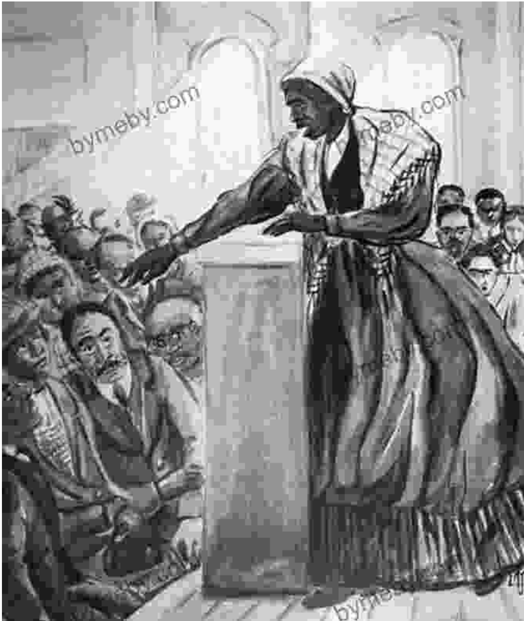
: The Unwavering Spirit of Sojourner Truth