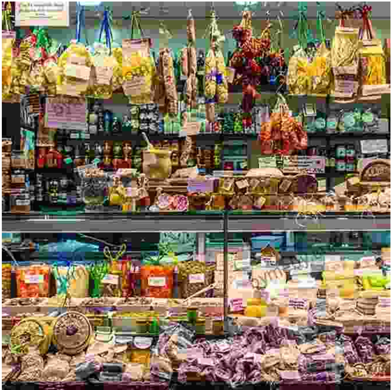
A vibrant array of fresh, local ingredients