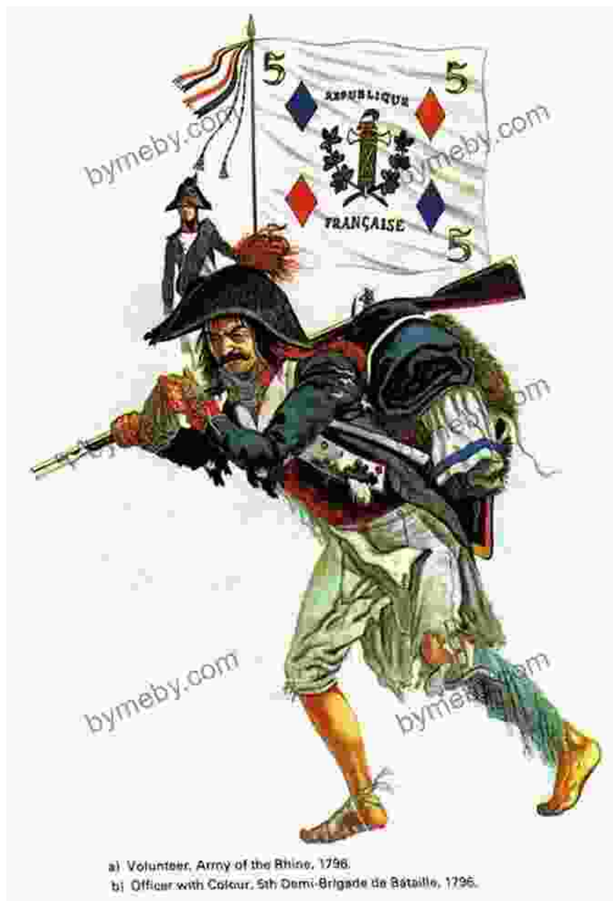
a) Volunteer, Army of the Rhine, 1796. b) Officer with Colour, 5th Demi-Brigade de Bataille, 1796.

Immerse Yourself in a Monumental Historical Narrative