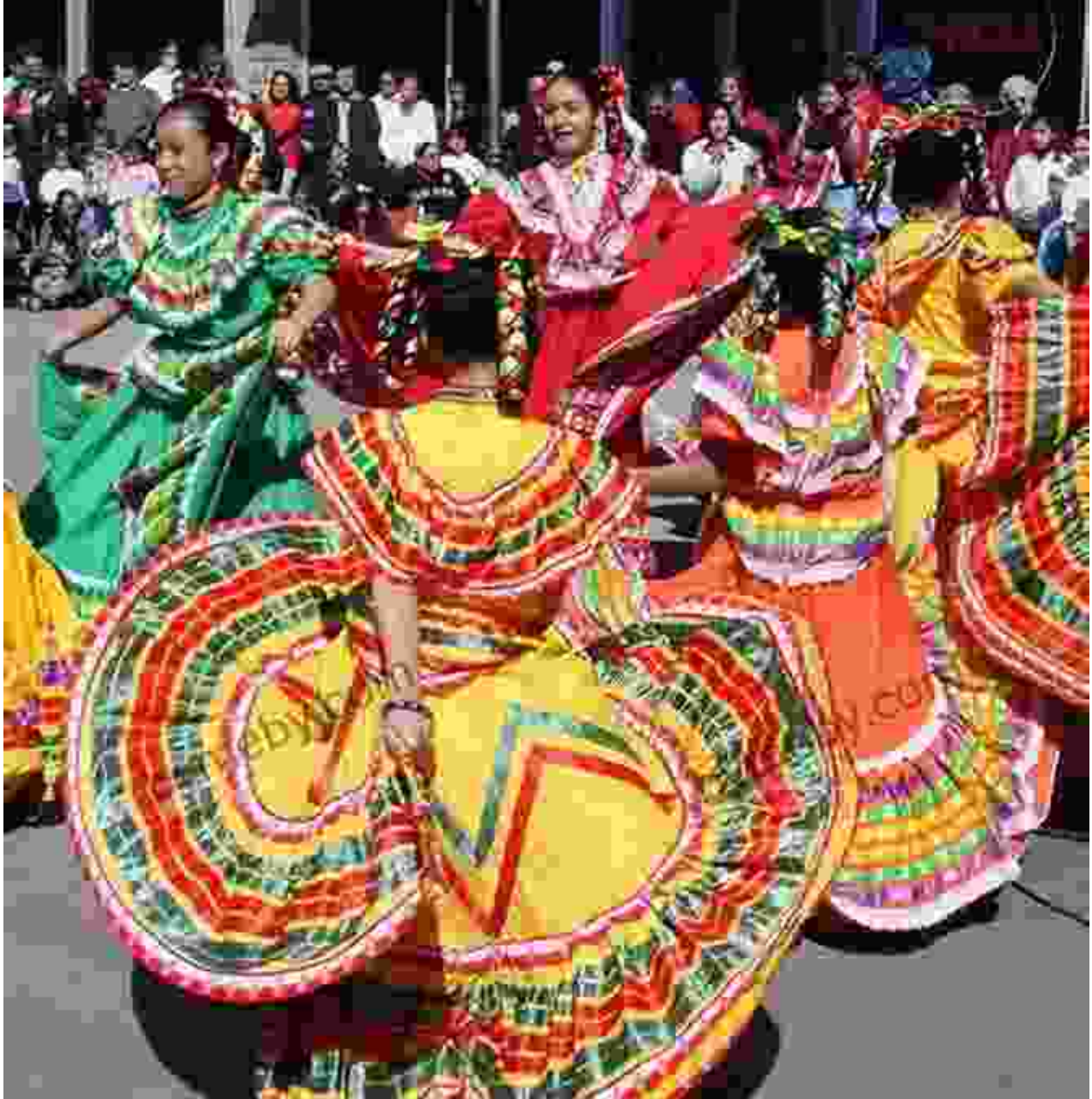
Cinco de Mayo: A colorful display of Mexican culture

From the vibrant colors of traditional costumes to the lively rhythm of mariachi music, Cinco de Mayo embodies the essence of Mexican identity. It is a time to gather with family and friends, share delicious food, and immerse oneself in the festive atmosphere that permeates every corner of the celebration.