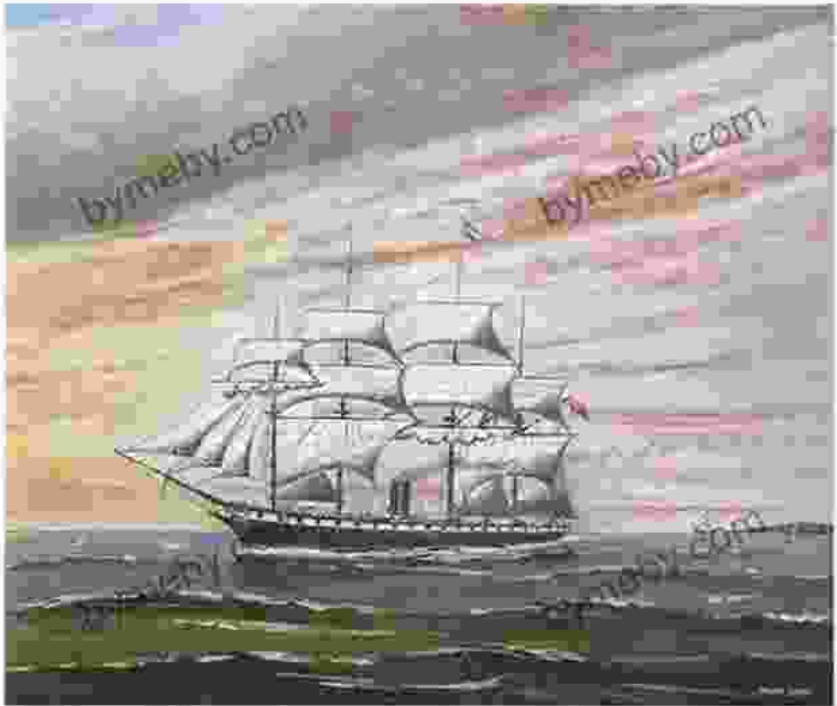
Britain's wonder, first, and last ship GREAT BRITAIN: Started off with six masts, then in June 1806 three were cut away, leaving her as a three-masted ship. At Bristol now we show her all to see.